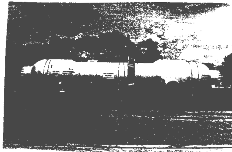
Figure 2 Stripper in urea process [ 9]

Infrastructure is another factor in selecting the location of the plant. The most important considerations in evaluating infrastructural conditions are electricity, transportation, communication, living conditions, educational facilities and recreational facilities. These apply equally to all the three locations and therefore can not be considered as critical factors. However, the ammonia/urea plant involves heavy pieces of equipment (e.g. the ammonia/urea reactors weigh about 100 to 200 tons and length of 30 to 50 m). Figure 2 illustrates as an example stripper in urea process.