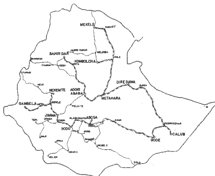
Figure 1 Specific regions pipline routing from Gas Field, ( . ) All weather road, ( - - - ) Pipeline route