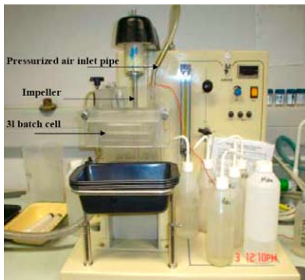
Figure 1 Schematic of the mechanical flotation cell

Flotation: After each chemical addition to the sample in the cell, agitation occurred for 2min at 400r/min. Air was subsequently induced at 4 l/min. Samples were drawn out of the supernatant fluid in the cell using a syringe at recorded time intervals. They were immediately analyzed using the turbidimeter. The experimental error was determined to have a coefficient of variation (relative precision) of 7%.