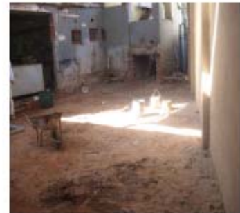
Figure 2 Photographs showing the progress of the company. Left two photographs shows the old state of the company, right photographs shows the old plating area cleaned and floors removed.