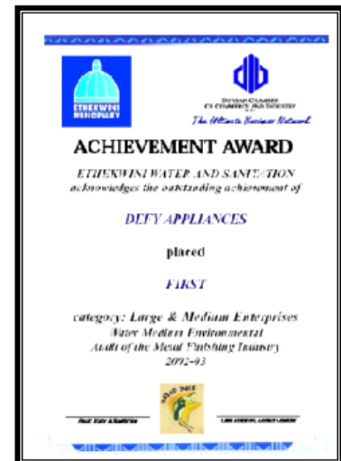
Figure 1 Achievement award

To date the company has removed all the old plating lines, the contaminated floor has been lifted and it has installed the first of the new plating lines using a cyanide-free plating method.