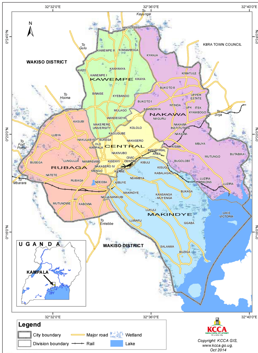
Figure 1. Map of the study area in Uganda showing location of divisions. Adapted from KCCA (2014)

While there were 1 897 NWSC customer connections in the study area, all of the 11 856 water connections in Kampala City Centre were taken as the population size ( N ), giving 372 connections as the sample size ( S ) from Krejcie and Morgan tables (320) plus 50 additional connections as a factor of safety. Cluster random sampling was used where the whole geographical population was divided into clusters (wards). A random sample from each cluster of 62 NWSC customers was performed (Wilson, 2010). This was done according to whether the customer had a water storage tank, accessibility and willingness to participate. This sample size was considered statistically significant and representative of NWSC customers in the study area and useful in drawing correct conclusions (Krejcie and Morgan, 1970). At a confidence level of 95% with an error of 0.05, the sample size gave valid and reliable results for a generalized population.