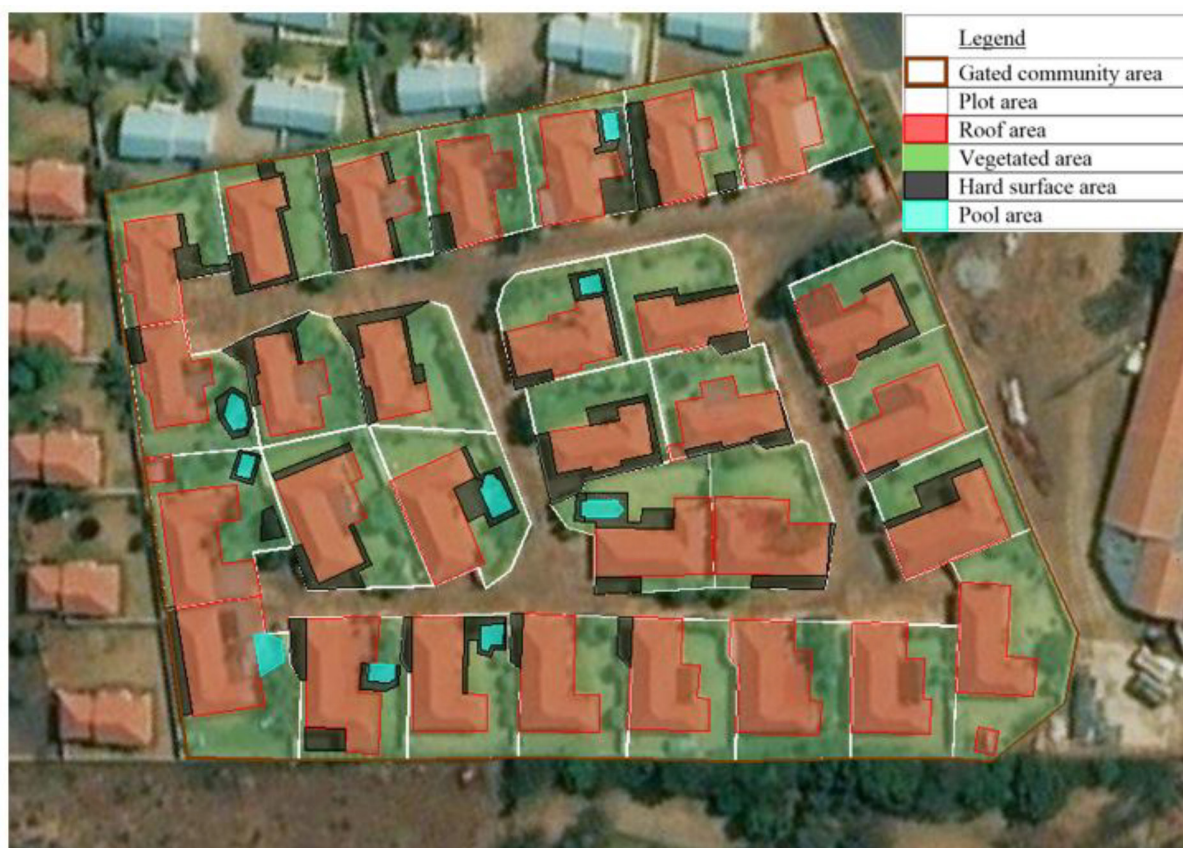
Figure 1. Typical example of garden footprint spatial disaggregation