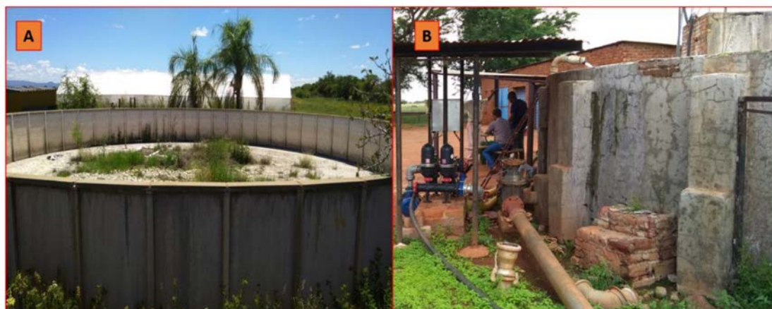
Figure 3. Typical water storage facilities in disrepair observed in Bela-Bela

We set out to generate empirical data that demonstrates the extent to which access to water may or may not be assured for emerging farmers once they obtain redistributed land, as well as the main challenges that limit use of the water available for economic production in Bela-Bela and Greater Sekhukhune. Findings from this study have enabled us to reach firm conclusions on this. For the majority of the farmers, access to water is not guaranteed and this negatively affects their