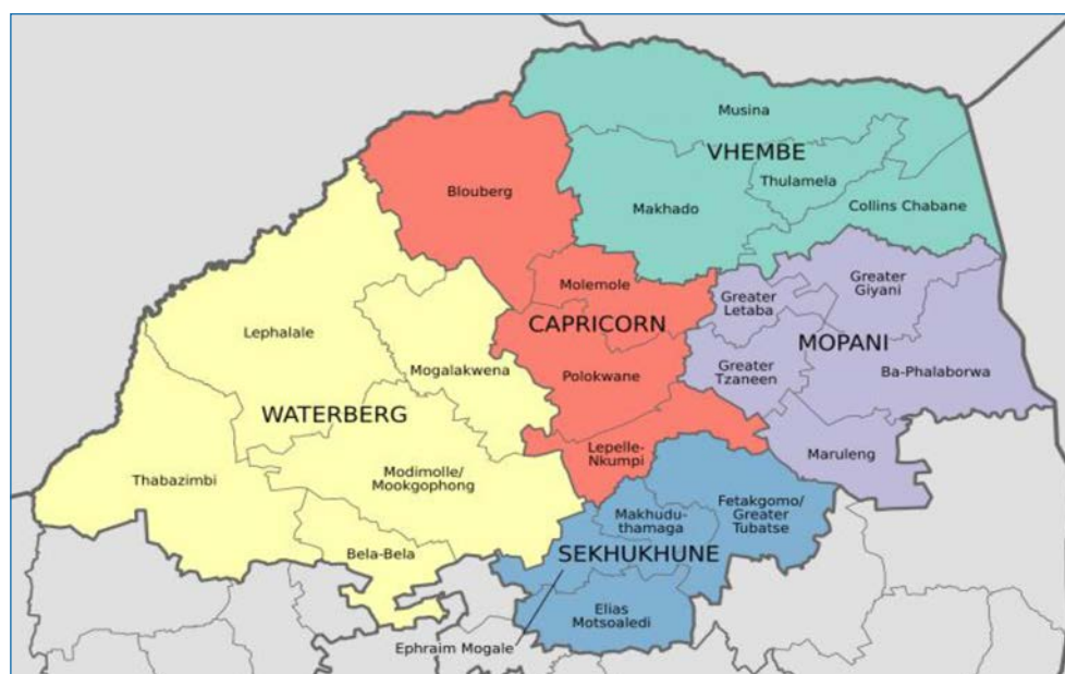
Figure 1. Location of the study sites (adapted from Greater Sekhukhune District Municipality, 2008)

Commercial agriculture provides the bulk of employment opportunities in the district, but more than half of the population (64.8%) is unemployed, particularly the youth (Stats SA, 2011). Although the district is viewed as having a high agricultural potential, 70% of the farmers, mostly black, are 'subsistence farmers' (Greater Sekhukhune District Municipality, 2008). Of these, 30.4% have access to land outside of their small homestead plots (Stats SA, 2011). The existence of very limited opportunities for employment has caused many people to migrate from the area to urban centres in Mpumalanga, Limpopo and Gauteng Provinces. Sekhukhune District is in a semi-arid hydrological region that receives about 450–500 mm of rainfall annually, with most of it in summer (Nowata, 2014). Low precipitation levels have made water scarcity an ongoing challenge in Sekhukhune District. Not only is the area drought-prone, but most of the available water has already been allocated to economic sectors such as tourism, commercial agriculture, industrial and domestic uses. Among all these sectors, it is generally agreed that