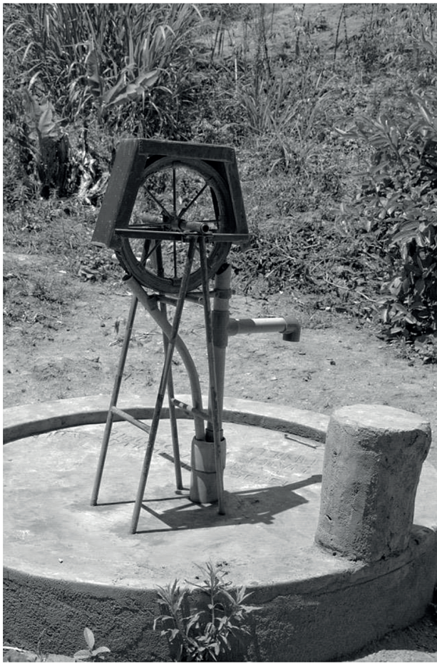
Figure 1. Rope and washer pump, Rumph District

generally in hard-to-reach areas and had participated in the selection of the rope and washer pump for their community as the technology was introduced under a supported development partner project (Holm et al., 2017). Manually drilled wells were completed between approximately April and October 2016. The drillers reported that the depth ranged from 9.8 to 21 m below ground surface. The pumps were installed at each well within a few months of completion. The wells in this study were within the same geographical area and were presumed to be accessing the same aquifer.