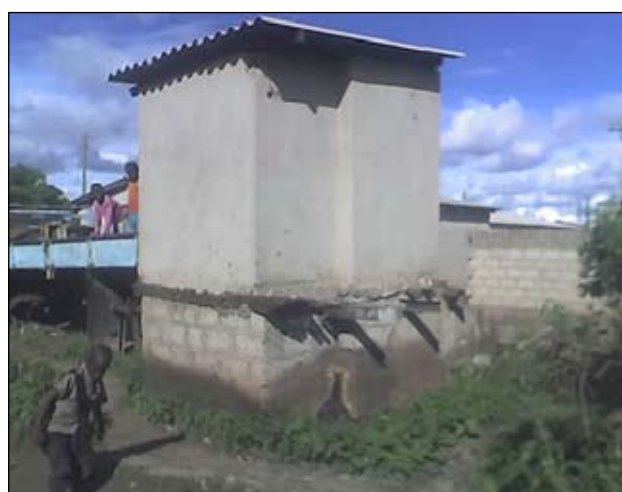
Figure 1 Raised pit latrine in the peri-urban area John Laing (rocky ground makes it difficult to dig pits)

Many residents in Chawama and John Laing use hand-dug shallow wells as a source of drinking water (see Fig. 2). This practice can be detrimental to their health since the groundwater quality in Lusaka fluctuates seasonally: it tends to deteriorate during the rainy season when pollution and recharge occurs due to pit latrines and the presence of preferential fast-flow mechanisms in the karst rock formations (Nkuwa, 2002). This problem is one of the causes of recurrent outbreaks of waterborne diseases in Lusaka's peri-urban areas (Mayumbelo, 2006). It is in fact a general problem for many areas in sub-Saharan