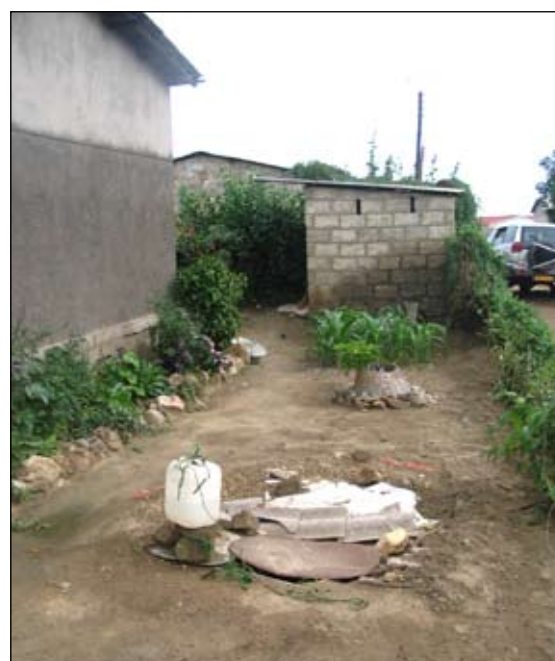
Figure 2 Hand-dug shallow well near a pit latrine (background) in the peri-urban area John Laing