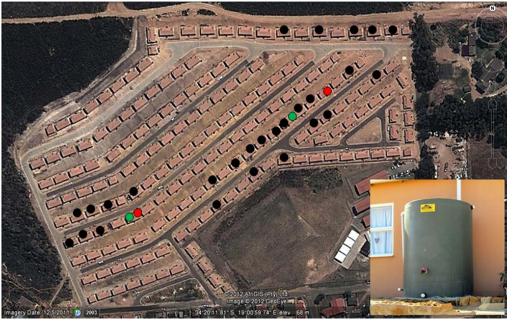
Figure 1 A map of the Kleinmond Housing Scheme (Western Cape, South Africa). The houses selected for sampling throughout the study are indicated by black circles. Green circles indicate the houses that were replaced with alternative, new houses (red circles) that were sampled from the 3 rd and 6 th sampling sessions.

Industrial Research (CSIR) and the Department of Science and Technology, was used as the sampling site. From a cluster of 411 houses, each fitted with a rainwater tank, 29 houses were randomly selected for sampling rainwater from the tanks during the study period (March to August 2012) (Fig. 1). Sampling was initially conducted every 3 weeks (March to May 2012), and thereafter 1 to 4 days after a rain event (June to August 2012). For microbial and chemical analysis, 232 tank water samples were collected in sterile 2-ℓ polypropylene bottles over the entire sampling period. The temperature and pH of the tank water at the sampling locations were measured using a hand-held mercury thermometer and colour-fixed indicator sticks with a pH range of 0–14 (ALBET®, Barcelona, Spain).