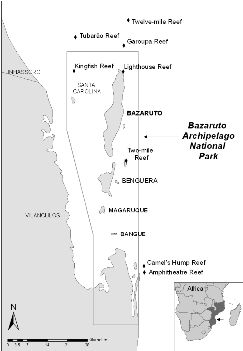
Fig. 1. Map of the Bazaruto Archipelago, Mozambique. Study sites are indicated by (◆).