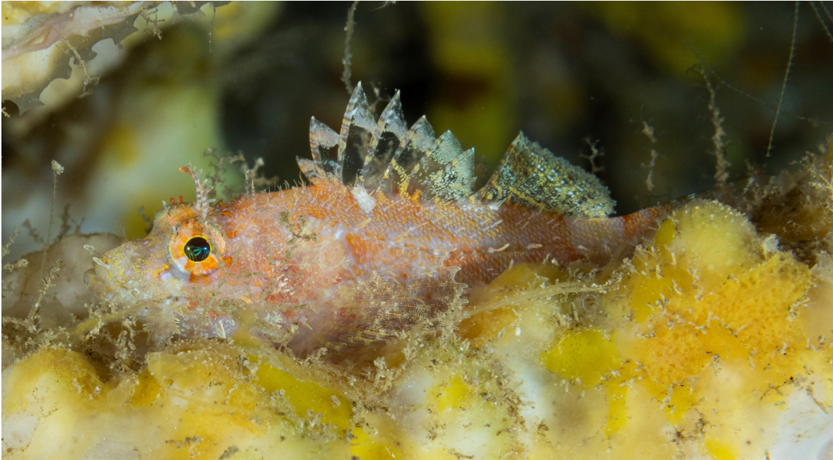
Figure 1. Neomerinthe erostris (Alcock, 1896). Specimen photographed in the mesophotic zone at Mayotte at 115 m depth on 11 November 2022.

suborbital ridges with 3 spines. Preopercle with 5 spines. Pored lateral-line scales ca. 25 (left side); vertical scale rows in longitudinal series ca. 39; predorsal scale rows ca. 8; scales on sides of body ctenoid; scale rows above lateral line 6, below lateral line 12. Occiput flat. Supraorbital tentacle large, posteriorly with 7 branches. Head with numerous additional tentacles; also numerous dermal tentacles on back and sides of body. Standard length ca. 100 mm.