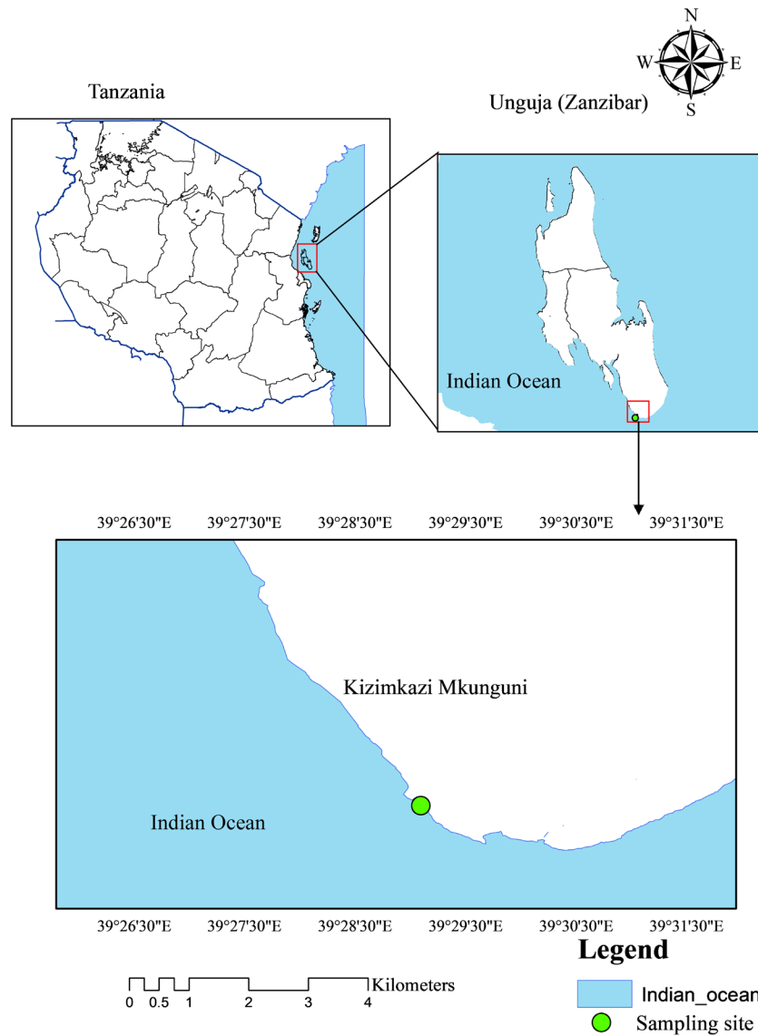
Figure 1. Map of Unguja Island showing location of sampling area at Kizimkazi Mkunguni.

Each tank contained a PVC tube of 10.16 cm diameter that was placed at the bottom of the tanks for the octopus to use as a refuge. Other habitat substrates such as pieces of dead hard corals and pebbles were also