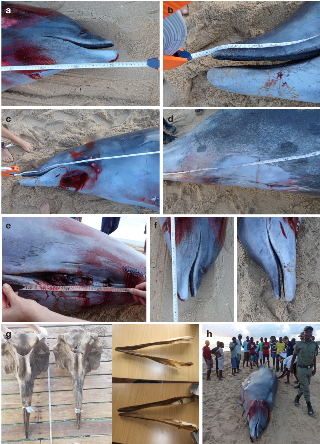
Figure 2. a) Whale 1 – Male, 4.71 m total length. b) Whale 2 – Female, 4.91 m total length, with absence of erupted teeth shown. c) Dark eye patch. Darker grey dorsal and light grey ventral colouration. Abrasions to the face suspected from movement of dragging by tractor along the beach (Whale 2). d) White elliptical around the genitalia, scars and lesions consistent with cookie cutter ( Isistius spp.) bites. Relative location of ano-genital openings further apart identified this whale, Whale 1, as male. e) Relative location of ano-genital openings and mammary slits close together were used to identify this whale, Whale 2, as female. f) No teeth were evident protruding from the mandibles of the fresh carcasses (Left - Whale 1 Male, Right - Whale 2 Female). g) Skulls and mandibles of both whales. Mandibles of both showing small tooth cavities visible (unfortunately burial was performed without record of relation to field identification). h) Presence of the police from 2:30 am and keen interest of the local community from 5.30 am through to the butchering of the carcasses at 4:30 pm (Whale 1).