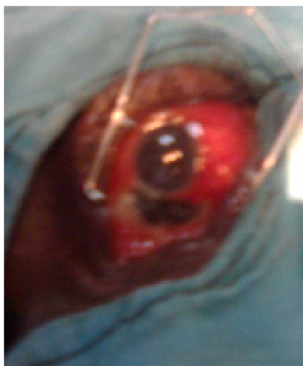
Fig. 1: Thin Scleral Bed with Uveal show (LE)

Our patient presented with SINS following pterygium excision on the left eye with the use of topical MMC. The inflammation was noted adjacent to the surgical site. There was no clinical or serological evidence of connective tissue disease; the liver function test was normal. The patient showed a good response to scleral patch with MMG and