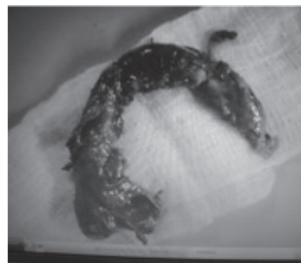
Fig. 3: Post-operative specimen of inflamed appendix about to rupture.