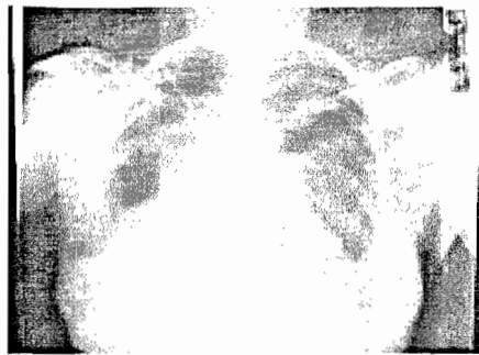
Figure 1: Chest radiograph showing right-sided pleural effusion

with pleural effusion. Thoracocentesis (performed three times) yielded a haemorrhagic aspirate that did not clot on standing. There was a vague pelvic mass on abdominal examination but no other organ enlargement was noted. The diagnosis of pulmonary tuberculosis was upheld in addition to that of an ovarian mass and the anti-tuberculous drugs were continued. A chest radiograph showed a right sided effusion (Fig. 1). Laboratory investigations showed a packed cell volume of 27% and a total white cell count of 5,200/ \mu L (neutrophils 30%, lymphocytes 67% and eosinophils 3%). The erythrocyte sedimentation rate was 38mm/hr and the human immunodeficiency virus serology was unreactive. Rheumatoid factor and the LE cell preparation were negative. Tuberculin skin (Mantoux) test was 7mm. The pleural aspirate was exudative with a protein content of 32 g/L but negative for acid-