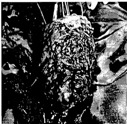
Figure 2: An excised advanced Wilms' tumour that had invaded inferior vena cava and other surrounding structures

patients within five years of age at diagnosis was 25.0%, whereas if the age-at-diagnosis six years or older the survival rate was 18.8% (p<.0001). Higher tumour stage and presence of distant metastasis were also factors predictive of a poor survival rate.