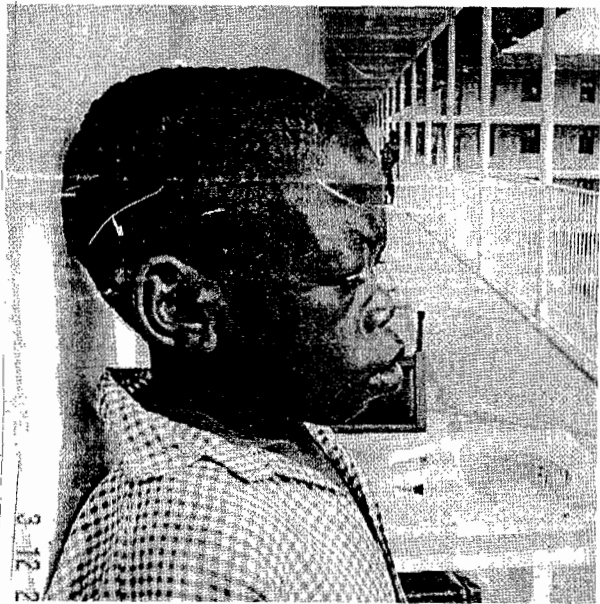
Fig. 1 shows large head, peri-orbital oedema, flat nose and thick lips

On further questioning he had tiredness on exertion, which had been progressive in the last 2 years and difficulty with seeing at night, which was worse in the last 6 months.