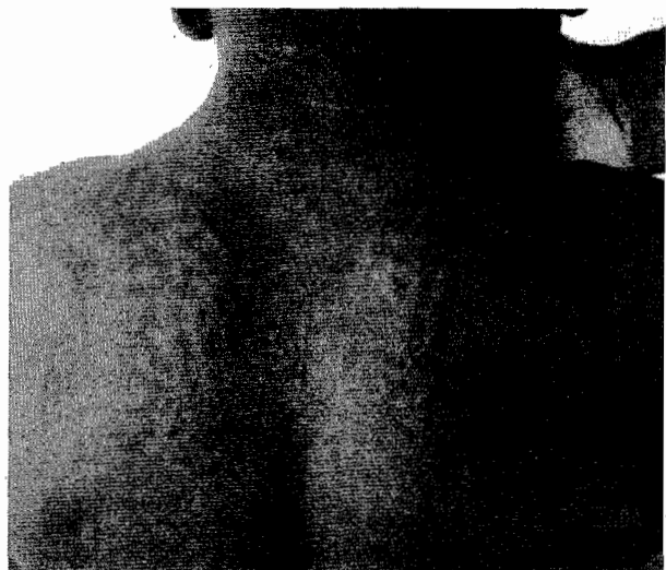
Fig. 2 Pebbly appearance of the skin, characteristic of Hunter syndrome.

There was no other significant past medical history. He was the second of 4 children. All other siblings were well. There is no family history of a similar problem. Mother claimed no member of her family had presented with a similar problem. The patient is presently in the third year in the secondary school and appears to be doing well.