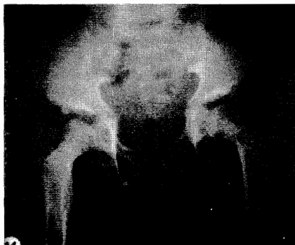
Fig. 5 Plain radiograph of the iliac bone showing an unusual tapering towards the acetabula with fusion of the sacro-iliac joint. The acetabula fossae bilaterally is sclerosed and shallow with irregular protuberances.

Ophthalmologic examination revealed a visual acuity of 6/5 in both eyes unaided. He had bilateral mechanical ptosis due to marked fullness of both orbits especially the upper lids. Anterior segments of both eyes were quiet and his