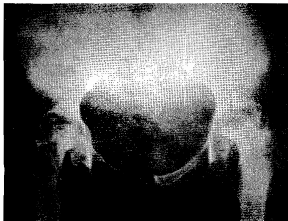
Fig. 1 X-ray of the pelvis showing osteonecrosis of both femoral heads with collapse and narrowing of both hip joints.

A 56-year-old trader presented to the Orthopaedic clinic with a seven-month-history of painful and stiff shoulders and hips, fever and weight loss. She had no cough or contact with anyone with chronic cough. There was no previous trauma to the shoulders and hips. She denied any previous use of steroids. She is not a known sickle cell disease patient. Examination showed a chronically ill elderly woman. She was pale and febrile. The peripheral lymph nodes were not significantly enlarged. The shoulder muscles were wasted bilaterally. There was tenderness in the glenohumeral joint and the range of movement was markedly reduced. Both hips were tender and there was marked limitation of all movements in the hips. X-rays of both shoulders and both hips showed necrosis and collapse of both humeral heads and femoral heads with narrowing of the joint