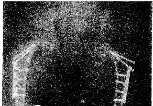
Fig. 2 X-ray of the pelvis after closed reduction and internal fixation of femoral neck fractures.