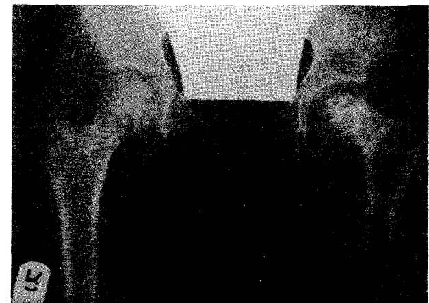
Fig. 3 X-ray of the patient one year and four months after trauma (a) immediately before implants removal, and (b) immediately after removal of implants. Avascular necrosis with varus deformity are obvious on the left side.