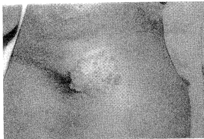
Fig. 1 Photograph shows a well-circumscribed crusted plaque of Bowen's disease on the lower part of the chest.

A 59-year old man presented to the dermatology clinic with a 5-year history of an occasionally mildly itchy, slowly enlarging lesion on the lower part of the anterior region of the chest on the right. He had worked as a forestry worker for 34 years until his retirement 6 years before presentation. During the first five years of his work, sodium arsenite had been used to poison some tree species but he denied using it