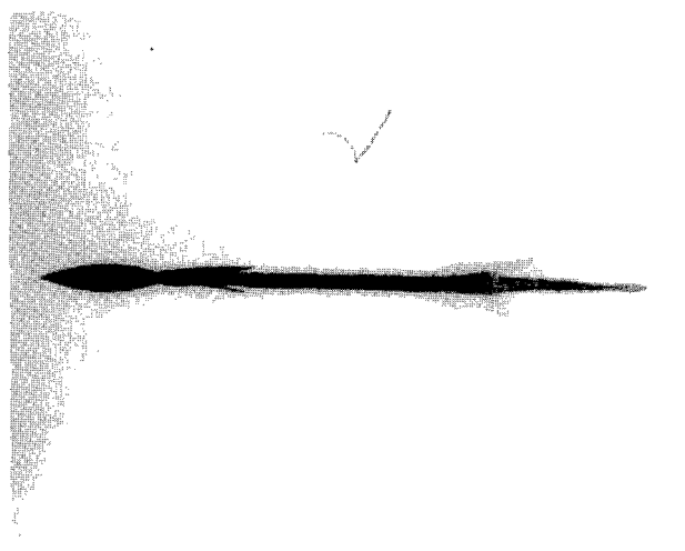
Fig. 3 Foreign object (Arrow) that was surgically retrieved from the patient (15cm in actual length).