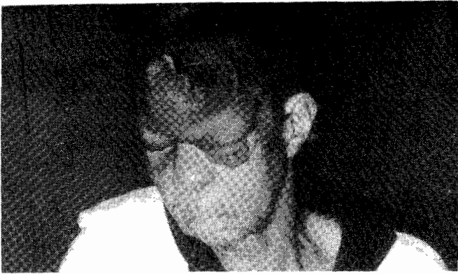
Fig. 1 Giant frontal sinus mucocoele with orbital displacement. Note the collapsed frontal swelling after spontaneous rupture.

amoxicillin capsule 500mg 8hrly for 7 days and ibuprofen tablet 400mg 12hrly for 3 days. Healing was uneventful and the patient was discharged home after 14 days. Follow-up appointments were fixed at three monthly interval and no complication was recorded during the first post-operative year. The patient was, however, lost to follow-up after the first year.