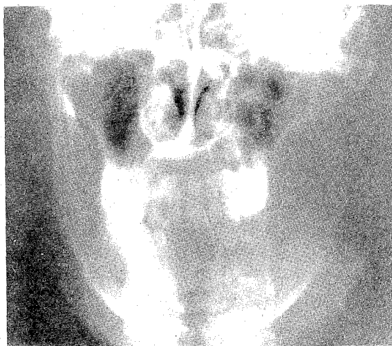
Fig. 2 Reconstruction of the hemimandible

There were 20 patients. Fourteen were males and 6 females. Their ages range from 11 to 42 years with a mean of 25.5 years, standard deviation 9.5. Thirteen patients presented with ameloblastoma, 2 ameloblastic fibroma, 3 ossifying fibroma and