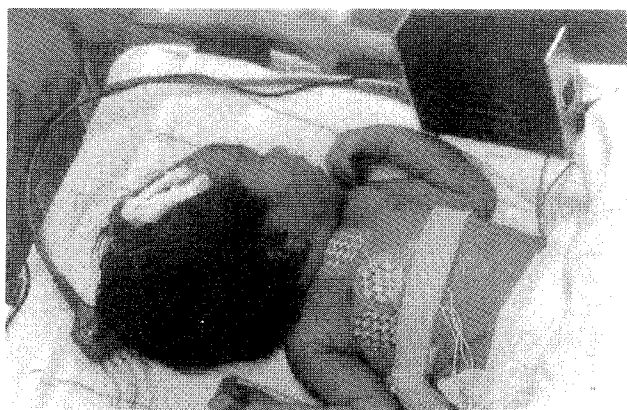
Fig. 1 24 Hour (Holter monitor) ECG recording in progress on a baby in a cot