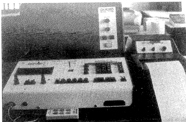
Fig. 2 The Oxford Medilog ECG analyzer with the chart recorder