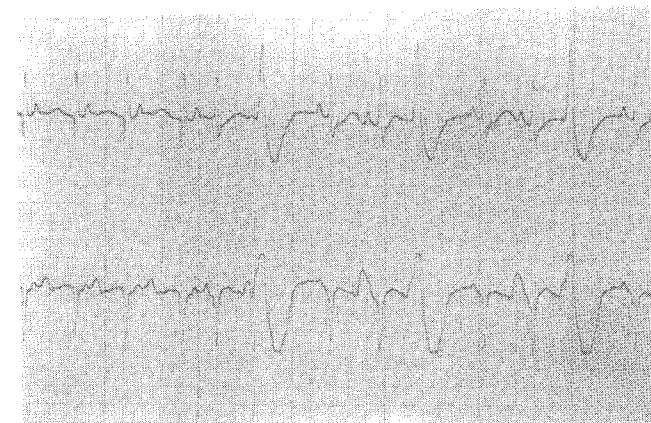
Fig. 5 Section of the 24-hour ECG strip chart recording in one of the asphyxiated Nigerian infants showing uniform PVCs.