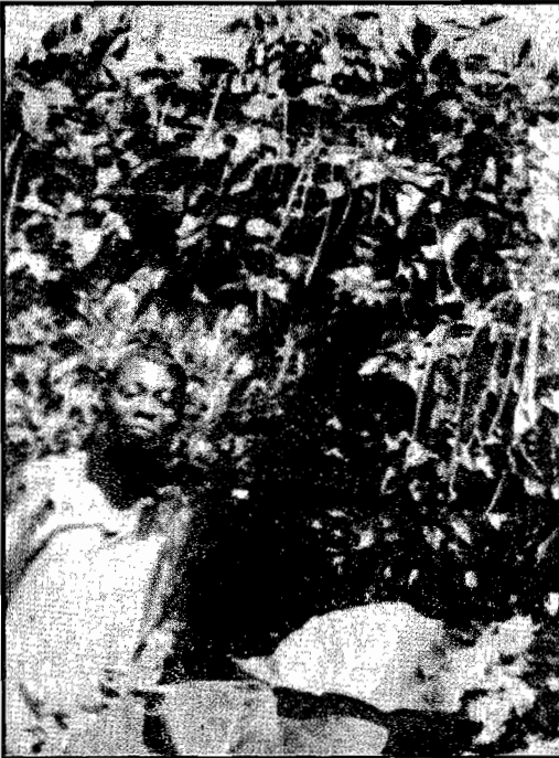
Plate 1 African yam bean: fruited plant in a farmer's field