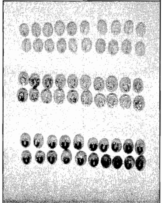
Plate 4 Variation in hilum colour in the African yam bean