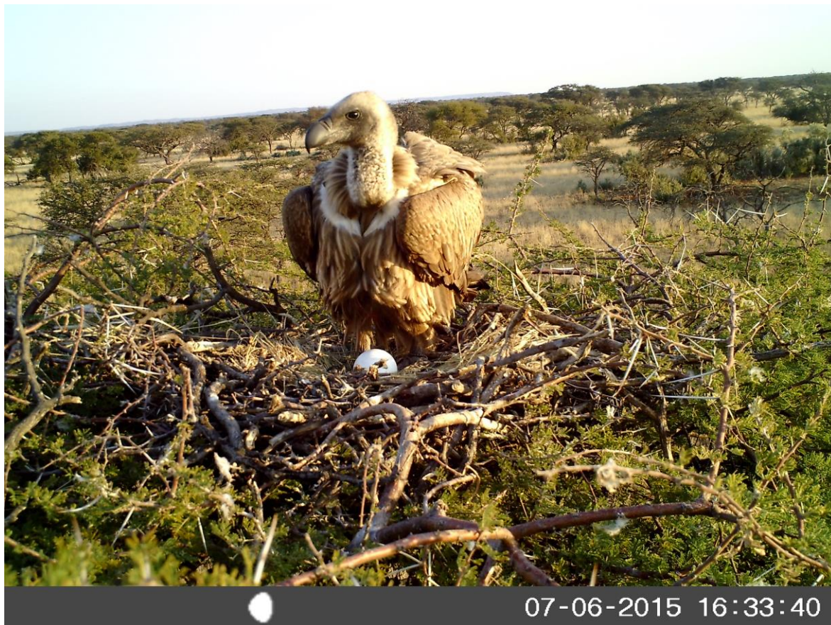
Figure 1: Camera trap image of an African White-backed Vulture Gyps africanus at its nest. Image shows the solo breeding bird.