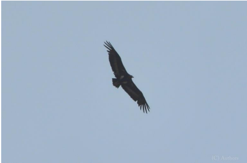
Figure 2: Sarcogyps calvus near Kutku village in Palamau Tiger Reserve.