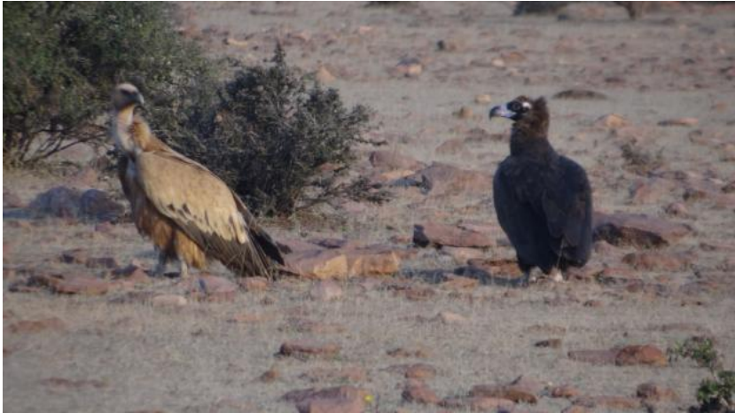
Figure 1: Griffon Gyps fulvus and Cinereous Vulture Aegypius monachus in Mukandara Hills Tiger Reserve.