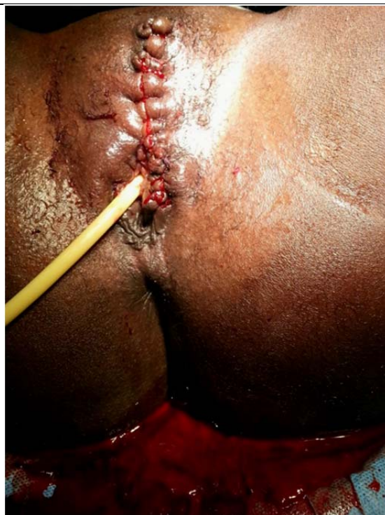
Figure 3: Appearance of the vulva after excision of clitoral cyst and vulva reconstruction