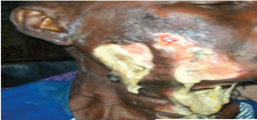
Figure 1: Cervicofacial Necrotizing fasciitis. Necrotizing fasciitis affecting face and neck of an adult patient with necrotic tissues in the wound.