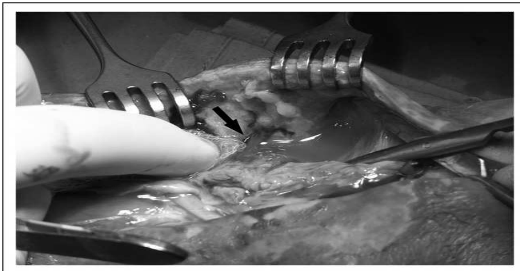
Figure 6: Foul-smelling, turbid “dishwater” pus seen in necrotizing fasciitis.

completely excisable. Zone 2 is carefully assessable to excise the non-viable tissue while protecting the salvageable tissue. Zone 3 is unaffected; it is therefore left untouched.