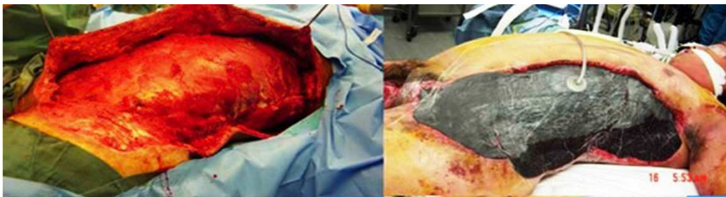
Figure 3: Abdominal and chest necrotizing fasciitis.

Figure (A) shows necrotizing fasciitis of left upper limb before surgical debridement while figure (B) after the debridement in the theatre. Figure (C) shows necrotizing fasciitis of the left lower limb before surgical debridement while figure (D) after the debridement.