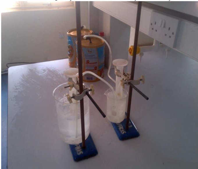
Plate 1: The Digester Set-up for the Production of Biogas.