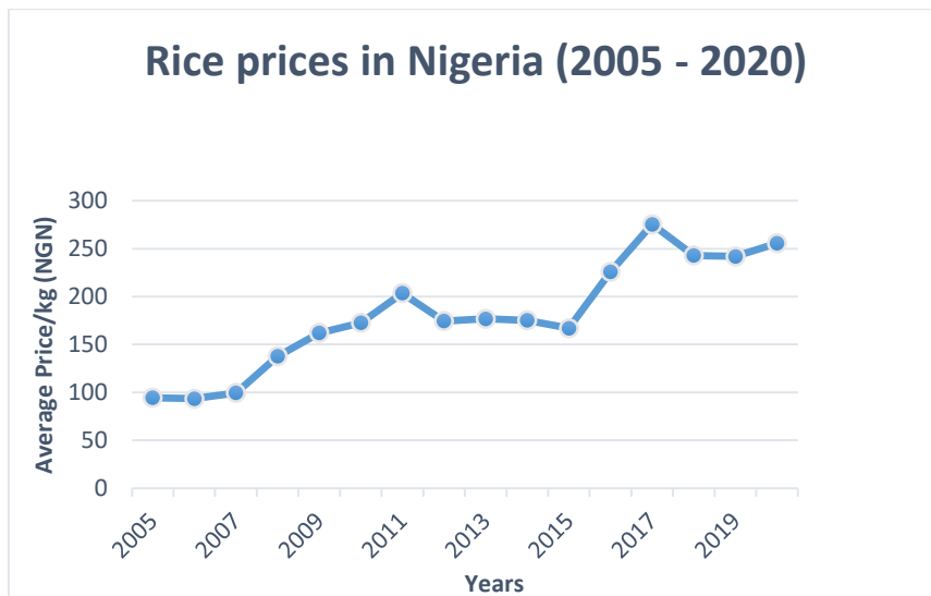
Figure 1: Rice Prices in Nigeria (2005 – 2020) – Average price per/kg (Naira)