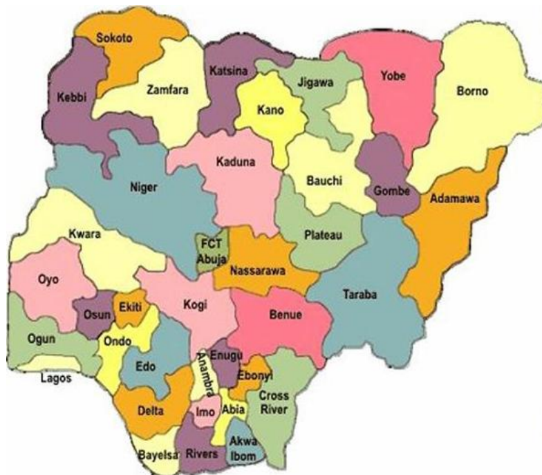
Fig. 1. Map of Nigeria showing the States of the Federation and the Federal Capital Territory (FCT)

Nigeria is a multi-ethnic federation divided in 1996 into 36 states and the federal capital territory at Abuja (Figure 1). There are over 350 ethno-linguistic groups with an estimated population growth of 140 million and an annual population growth of 2.8% (Federal Republic of Nigeria Gazette, 2007). As part of an ongoing project on heredity and the sense of taste of the Nigerian population, this study was undertaken to investigate the distribution and frequency of PTC taster and non taster alleles in the Nigerian population. This is expected to generate a database and provide an understanding on the distribution of this genetic trait among Nigerians. It will also extend current knowledge on how variable Nigerians are genetically, in terms of taste perception.