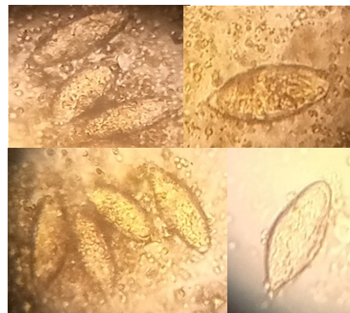
Plate 1. Ova of S. haematobium encountered