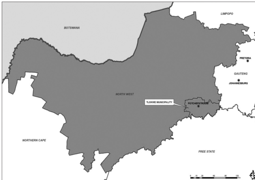
Figure 1(a): Study area: Potchefstroom, North-West Province, South Africa