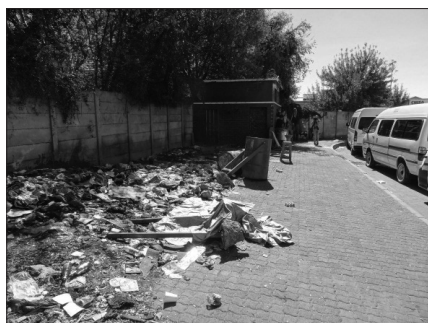
Figure 4: Examples of urban decay

and pedestrians. At the time of the observations, the built environment showed signs of urban decay (see Figure 4), such as a lack of maintenance (presence of litter and broken sidewalks), vandalism (broken windows and graffiti), and a visible consciousness of crime (illustrated by target-hardening security measures, such as fencing on building roofs, bars in front of windows, Closed Circuit Television Cameras, and alarm systems). The physical space has almost no greenery (trees and shrubs).