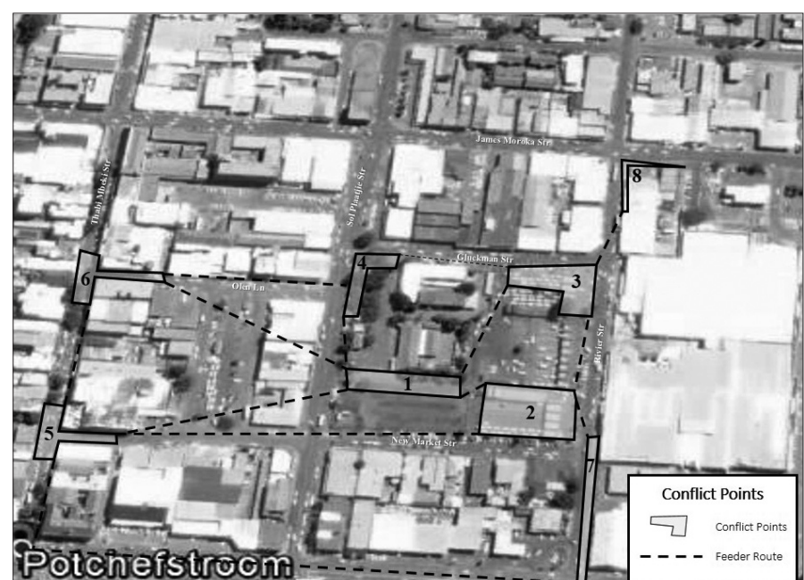
Figure 2: Conflict points for social interaction

Social interaction is not equally distributed throughout the study area, but concentrated in eight primary zones of interaction. These conflict points (Maree, 2007: 101) are areas where intense pedestrian movement,