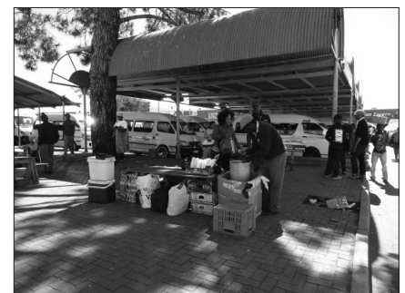
Figure 5: Examples of social interaction (pro-social behaviour)