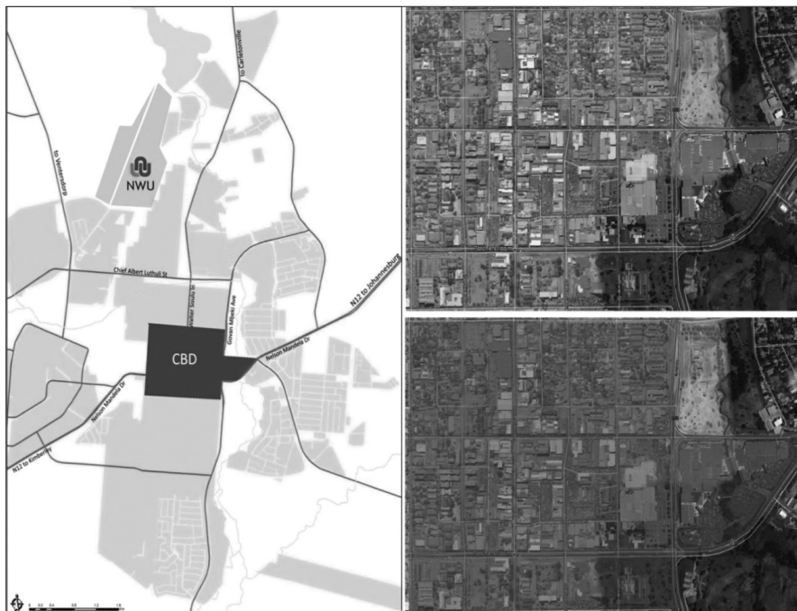
Figure 1(b): Study area: Potchefstroom Central Business District

are proposed, because physical planning/design cannot be separated from the non-visible context (e.g., social aspects). With this in mind, the empirical section of this article will discuss possible methods and tools to explore social systems in a Central Business District.