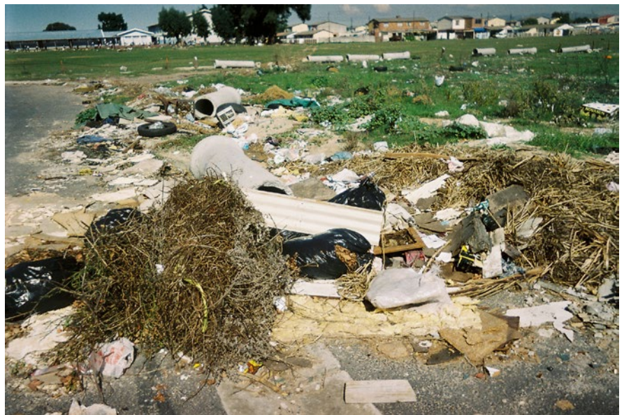
Figure 2: Illegal dumpsites near Arcadia Primary

During the 1990s, the area was plagued by numerous sources of pollution. Land pollution was characterised by extreme littering in all the streets and parks. Illegal dumping compounded the issue,