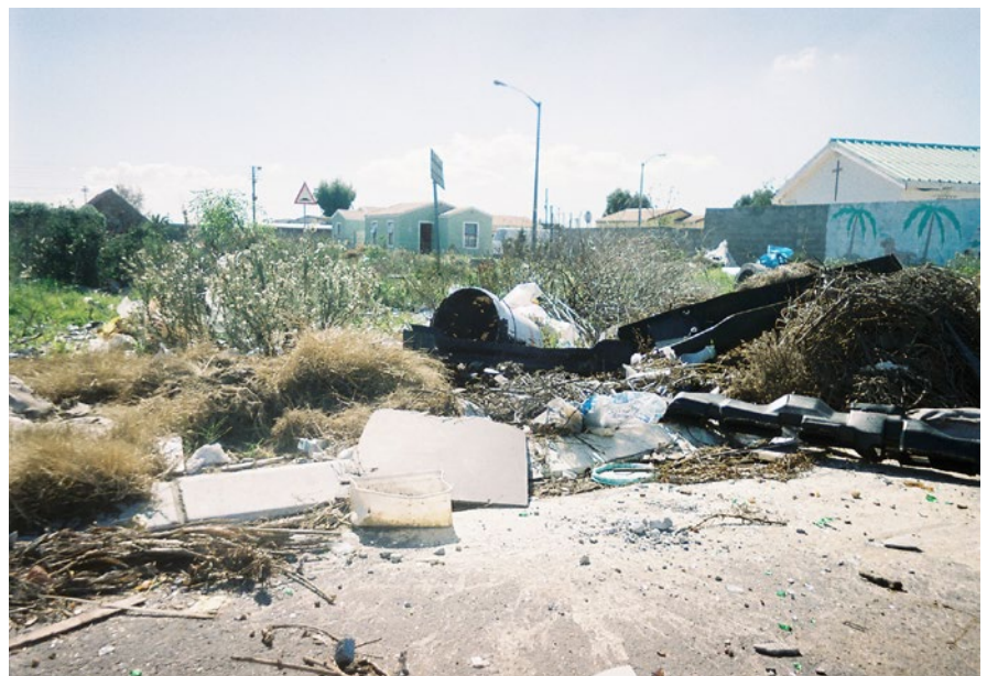
Figure 3: Illegal dumpsites near Bonteheuwel houses and a church