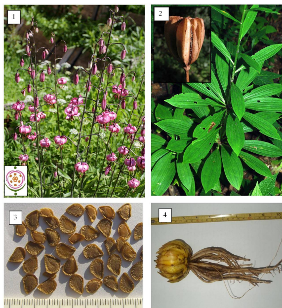
Figure 1: Lilium martagon L.: (1) upper part of the stem, inflorescence with floral diagram in flowering period; (2) upper part of the stem and capsule after flowering period; (3) seeds; and (4) closed bulb with roots [8,33].