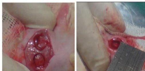
Figure 1: Defects were made on calvaria in both parietal bones

After 4 weeks, four rats were randomly chosen and sacrificed while the remaining four were sacrificed after 8 weeks. The rats were sacrificed in a CO 2 chamber. Thereupon, the resected rats' calvaria pieces were fixed in 10% formalin. They were then decalcified, embedded in paraffin, and sectioned into 5 μm slices at the center of defects. Staining the tissue sections was performed using Masson's trichrome and Hematoxylin-Eosin protocols [15-21]. The stained tissue sections were inspected under a light microscope (Leica, Germany) at × 40 magnification. The newly formed bone was evaluated in each group using ImageJ software [5] and reported.