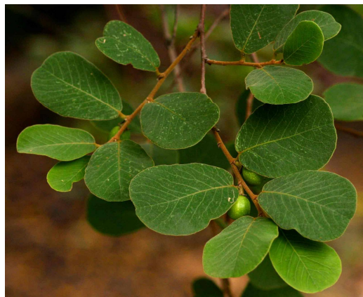
Figure 1: Bridelia mollis : a branch showing leaves and fruits

included conference papers, books, scientific articles, book chapters, theses and dissertations obtained from the University of Fort Hare library.