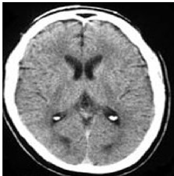
Figure 2: CT scan taken after treatment with mesenchymal stem cells

IV patients reported better quality of life than patients in Groups I and II.