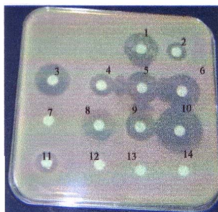
ESBL producing K. Pneumoniae