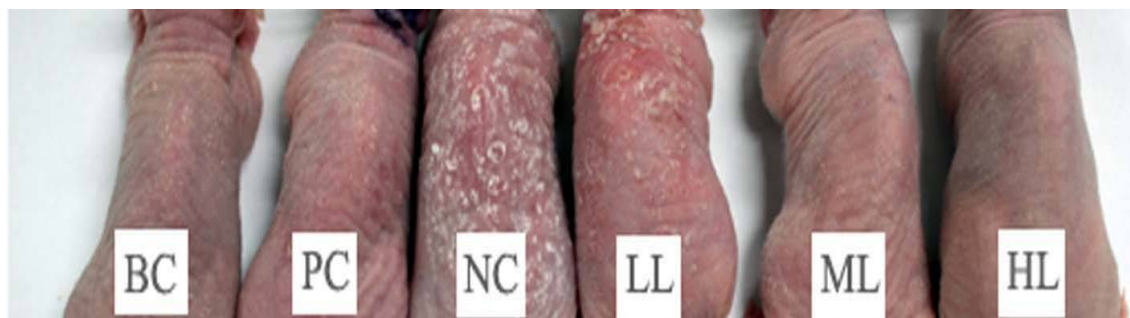
Figure 1: Effect of UV-B and EGCg on skin aging of hairless mice. BC: blank control, neither EGCg nor UV-B irradiation; PC: positive control, receiving topical application of KIEHL'S ultra light daily UV defense (SPF50 PA+++)) and UV-B irradiation; NC: negative control, receiving topical application of vehicle solvent (acetone) and UV-B irradiation; LL: low level EGCg treatment, receiving topical application of 1.0 mg/mL EGCg dissolved in acetone and UV-B irradiation; ML: medium level EGCg treatment, receiving topical application of 10.0 mg/mL EGCg dissolved in acetone and UV-B irradiation; HL: high level EGCg treatment, receiving topical application of 50.0 mg/mL EGCg dissolved in acetone and UV-B irradiation

Differences in the thickness of the stratum corneum layer of the skins were recognized based on the type of treatment (Figure 2, Table 1).