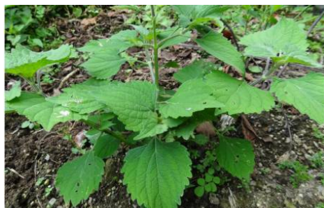
Figure 1: Anisomeles indica (L.) Kuntze plant

Anisomeles indica (family Lamiaceae) (Fig. 1) is an erect camphor-scented perennial woody shrub that grows in the wild in Southeast Asia. Anisomeles indica Kuntze, which is commonly known as “yu-zhen-tsao”, is the only species of Anisomeles found in Taiwan [8,9]. It is used in folk medicine for the treatment of diverse conditions, such as inflammatory disease, liver disease, intestinal infections, abdominal pain and immune system deficiencies [10]. Although A. indica has been used for health improvement in Taiwan, its anti-fatigue effects have not yet been reported.