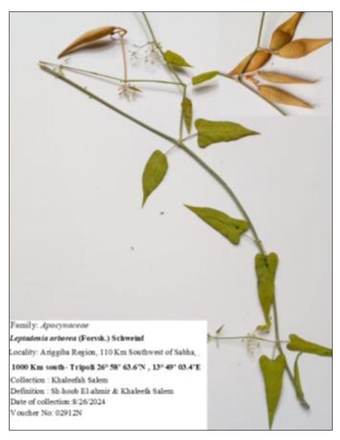
Fig 3. Herbarium specimen of Leptadenia arborea (Forssk.) Schweinf. collected from Ariggiba region, Sabha, Libya.

This finding is significant as of L. arborea was not previously documented in the flora of Libya compiled by Jafri and El-Gad (1989) and Keith (1965), indicating that this represents a new addition to the plant species diversity of the country.