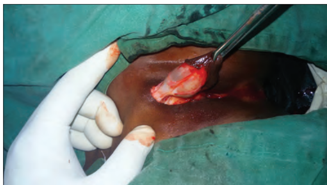
Figure 2: Enucleation of the inclusion clitoral cyst