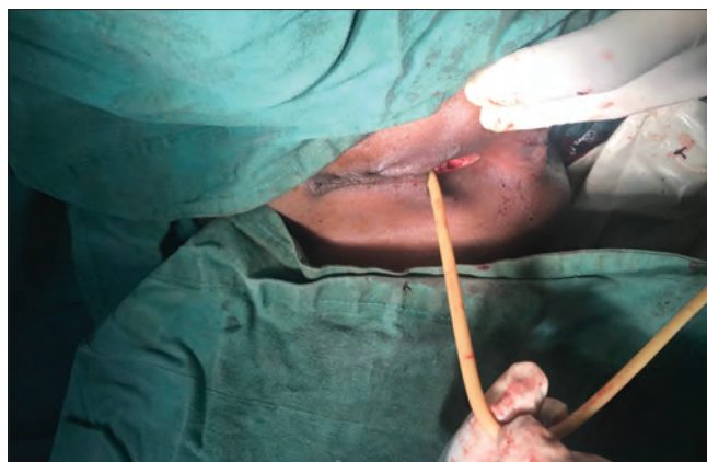
Figure 3: Reconstructed perineum after removal of clitoral cyst with Foley catheter in situ