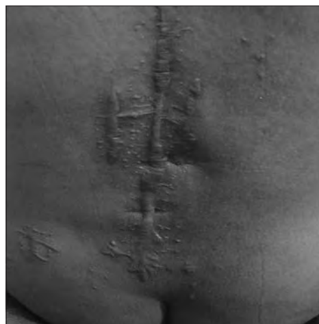
Figure 1: Back view of patient showing surgical scars

Six months after counseling and commencement of high-dose folic acid, she presented with an ultrasound confirmation of an 8-week intrauterine gestation. Laboratory investigations were within normal limits at antenatal booking. She was encouraged to continue high-dose folic acid and hematinics. Anomaly scan performed at 22 weeks was normal. The SCS was deactivated and remained so throughout the remaining period of pregnancy. The patient had prophylactic nitrofurantoin from the second trimester up to 34 weeks to reduce the incidence of recurrent UTIs. Delivery options were discussed and an elective Caesarean section at term