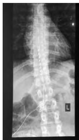
Figure 2: X-ray of thoracolumbar region showing the Spinal Cord Stimulator leads at T9-T11