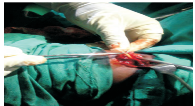
Fig 4: Dissection and Extraction of Implant. 6