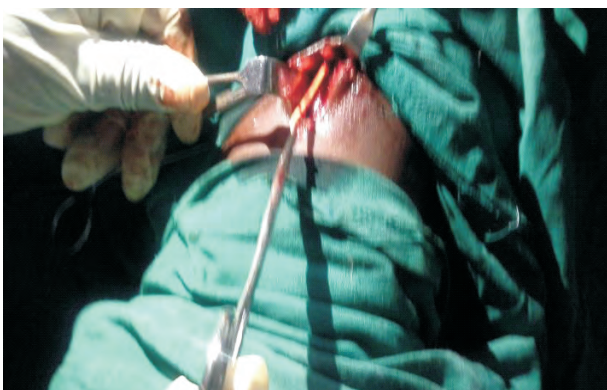
Fig 1: Ultrasound Identification and Location.

She was scheduled for removal under general anaesthesia, the skin/depth parameter, together with the precise position of the implanon (in muscle), facilitate removal. The cavity where the implant was removed was closed and there was no post -operative complications. Supportive therapy was commenced with analgesics and prophylactic antibiotics and she was discharged home second day post –operation. 4