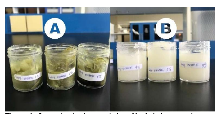
Figure 1: Organoleptic characteristics of herbal ointments from Oregano vulgaris hydrocarbon base. A: Extract ointment; B: Ointment essential oil.

According to SNI 16-4399-1996, prepared ointment formulations had an optimal viscosity, with typical viscosity values ranging between 2,000 and 50,000 (Table 3). This study found that the viscosity of the ointment formulated from O. vulgaris extract increased as the concentration increased. This is likely caused by high molecular-weight compounds in the extract, such as proteins, polysaccharides, or other biopolymers. These compounds can interact with each other and the ointment base, forming a more structured and less fluid network as the concentration increases. The results of the present study showed that the 96% ethanol extract had a higher viscosity than the essential oil of Oregano vulgare, as illustrated in Table 3. Extracts may contain components that bind water, contributing to increased viscosity. Conversely, the viscosity of ointment formulated from essential oil decreased as the concentration increased. Essential oils are generally complex mixtures of low molecular weight compounds,19 most of which are hydrophobic,<sup>20</sup> and have a lower interaction capacity with the ointment base,<sup>21</sup> compared to the compounds in O. vulgaris extracts.