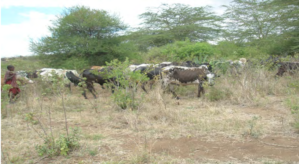
Plate 1: Livestock grazing in the Rundugai river catchment

The socio-economic factors influencing water use conflicts identified in the study area included the age of the respondents, size of farm and gender. This study identified that people in the age class between 38 and 47 years old were more involved in the use of water resources compared to other ages. This was because people within this age group were composed of the productive age. This implies that increasing number of people of age class of 38 – 47 years old by one year in the area; increase the chances of conflicts over water resources. The proportion of people with the age of between 48 and 57, 58 and 67 years old were low comparable to that of > 67 years old, probably due to low life expectancy for the latter group.