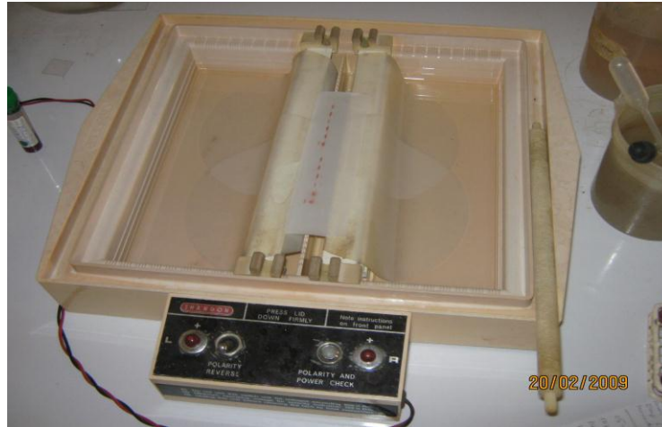
Fig 2- An electrophoresis tank showing acetate strips and band separations as a result of current flowing from a galvanometer.