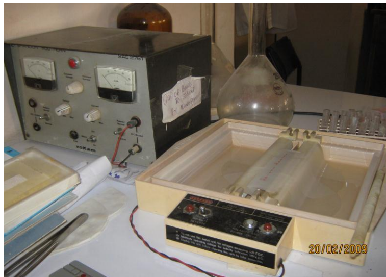
Fig 3- An electrophoresis tank with galvanometer